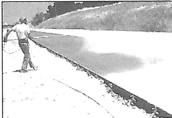
Application of liquid membrane-forming compound with hand sprayer.