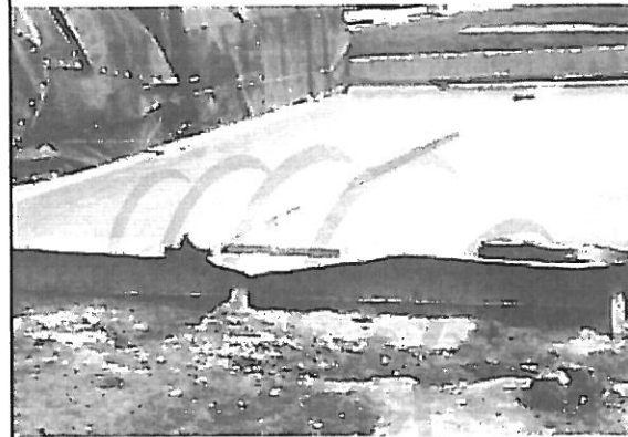
Slab on grade covered with waterproof paper for curing.