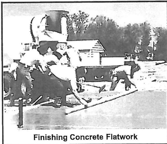
Finishing Concrete Flatwork

the concrete's slump. Start at the far end placing concrete into previously placed concrete and work towards the near end. On a slope, use concrete with a stiffer consistency (lower slump) and work up the slope.