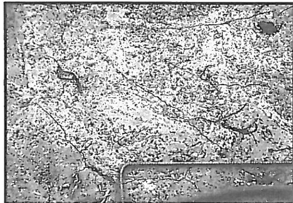
Thermal cracks in a thick slab

The main factor that defines a mass concrete member is its minimum dimension. ACI 301 suggests that a concrete member with a minimum dimension of 4 feet (1.3 m) should be considered as mass concrete. Some specifications use a volume-to-surface ratio. Other factors where precautions for mass concrete should be taken even for thinner sections are with higher heat generating concrete mixtures - higher cementitious materials content or faster hydrating mixtures. The main concern with mass concrete is a high thermal surface gradient and resulting restraint as discussed above. These conditions can result during the initial stages due to heat of hydration and during the later stages due to ambient